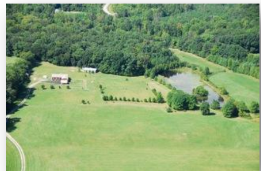
Conservation Land - Powhatan County