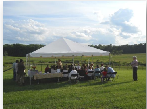
Educational event at Bandana Farm - Hanover

As a result of its outreach efforts, CRLC began working this year with 8 new landowners interested in exploring their land protection options. But most significantly, our ongoing work on 4 projects over several years yielded tangible results. By the end of 2011, CRLC had facilitated the preservation of 4 parcels of land totaling over 500 acres . These included: